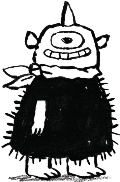
The cyclops car!