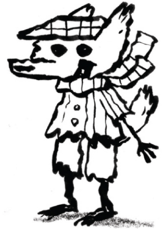
The werewolf car!