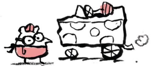
Mousers already has one.