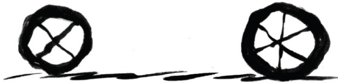
The mummy car!