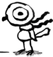
Little bird wants a car, too.