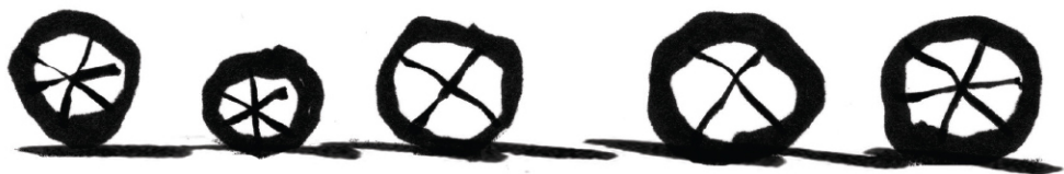
The skeleton car!